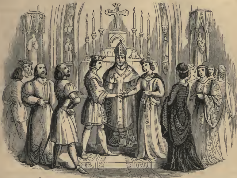
MARRIAGE OF PHILIP D'ARTOIS AND LADY MARY DE BERRY. Designed from Monuments of the family at the Château d'Eu.

the king was continually solicited by his uncles, who were desirous of advancing sir Philip d'Artois, and degrading sir Oliver de Clisson ; for the duke of Berry hated him for the death of Bethisac, and the duke of Burgundy for his opposition to the duke of Brittany ; but the duchess of Burgundy was yet more inveterate against him than her lord. The king at length gave his assent, on condition the duke of Berry gave him his daughter.